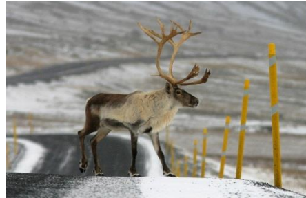
Reindeer on the road in the Eastern Fjords