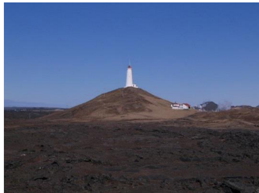
Lavafield, Reykjanes light house, steam of power plant and geothermal area Gunnhver