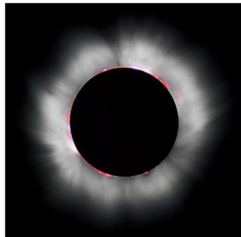
Total solar eclipse from 1999 in Germany