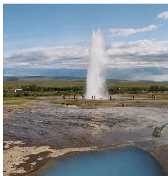
Strokkur spouting