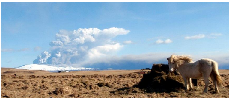
Eyjafjallajökull erupting in April 2010 from Hvollsvöllur